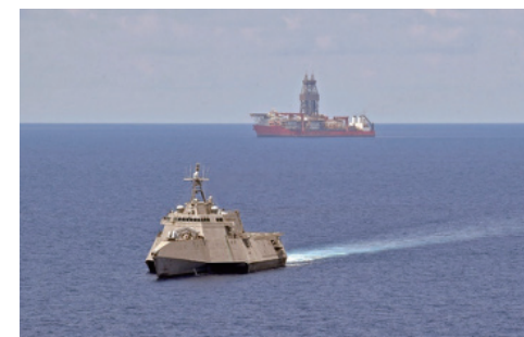
LCS USS Gabrielle Giffords maintaining presence near the drill ship West Capella

In the past, China sporadically attempted to put pressure on Malaysia and Vietnam's exploration and development activities in