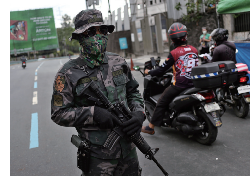
A Philippine military personnel conducting lockdown inspections in Manila

Figure 4.1 shows trends in COVID-19 cases in the ten ASEAN member states. Among them, Indonesia and the Philippines accounted for about 80% of the total COVID-19 cases and about 90% of the total deaths in the region as of the end of 2020. 3 Indonesia has seen cases rise almost consistently since the beginning of the outbreak and clearly has not succeeded in containment. The Philippines recorded fewer cases after they peaked in August and September. However, infections have nearly levelled off since then, and containment has not been achieved.