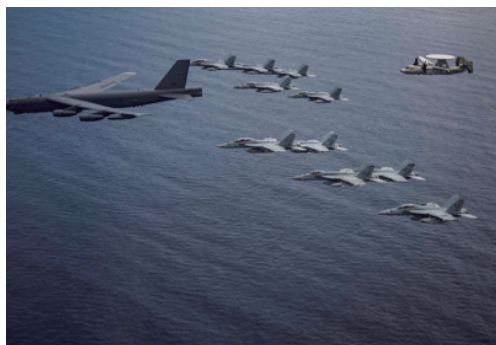
B-52Hs participating in an aviation drill with carrier-based aircraft during the dual-carrier exercises

The United States, on the other hand, deployed four B1-B bombers from the 7th Bomb Wing (Dyess Air Force Base, Texas) to