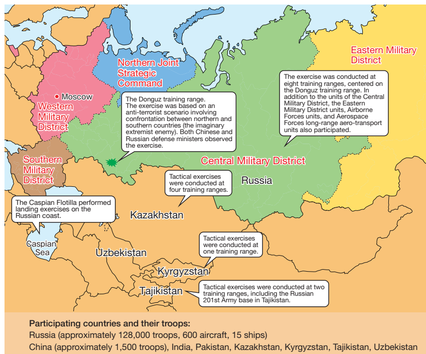
Figure 5.3. The Tsentr-2019 exercise, mainly held in the Central Military District