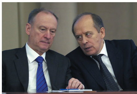
Russian Security Council Secretary Patrushev (left) and FSB Director Bortnikov (right)

In addition to planning and deciding the national security policies, two important functions have been given to the Security Council. They are regional