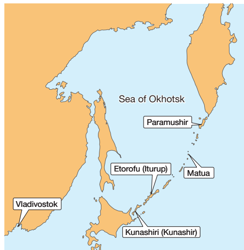
Figure 5.1. The Okhotsk Sea and surrounding areas

influence of foreign countries. Additionally, due to the creation of the Northern Sea Route, a new factor is being added, namely that the Sea of Okhotsk will become the route by which foreign ships from Asia head toward the Arctic Ocean. Therefore, in recent years, Russia has carried out military exercises repeatedly and aimed to strengthen its military presence through the modernization of its military power, etc., in order to maintain its own influence in the Arctic Ocean and the Sea