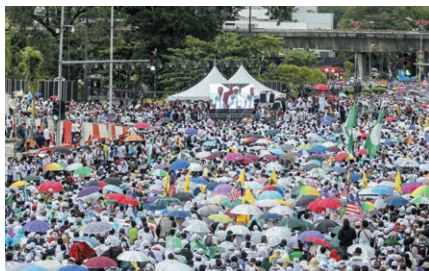
People participating in a rally at the anti-ICERD demonstration in Kuala Lumpur

this could affect the existing special position of the bumiputera. The government's subsequent retraction of the ratification policy demonstrates that relations among ethnic groups are still a very sensitive topic. The third point is the domestic trend of Islamism. Parti Islam se Malaysia (PAS; Malaysian Islamic Party), a major Malaysian political party, is an