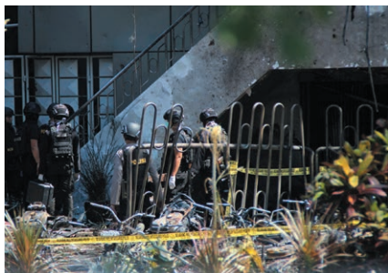
Surabaya church attacked by a suicide bomb