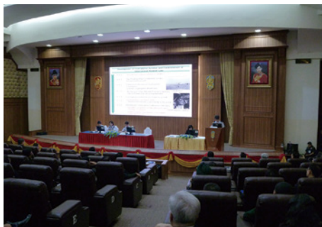
Seminar on international aviation law at the National Defense College of Thailand

ASEAN countries, who were given briefings by SDF staff, including an overview and history of aviation law, the principle of freedom of flight over international waters, and an outline of the Air Defense Identification Zones (ADIZ). According to Ministry of Defense staff who took part in the seminars, the Thai military personnel showed great interest in the contents and