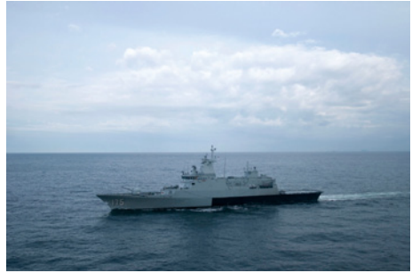
Kedah-class corvette

capabilities. As it pushed ahead with development of offshore oil and natural resources, Malaysia decided that submarines, with their asymmetrical power, would be useful as a deterrent, and the Navy had already showed its interest in acquiring some by the late 1980s. Fiscal circumstances meant that any specific planning had to be put off for the moment, but as various