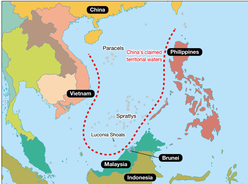
Figure 5.1. South China Sea