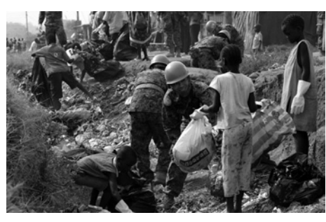
SDF personnel collecting garbage with local children

In April 2012, a military clash broke out between the Sudanese and South Sudanese armies over oil interests in the border area. In response to concerns about worsening security, the Ministry of Defense dispatched a six-person survey team in May to study the local situation. As a result of this study, Minister of Defense Naoki Tanaka confirmed the government's intention to continue with the SDF operation in South Sudan, and issued an order on May 11 to dispatch a second GSDF engineer unit (about 330 personnel) to South Sudan. The second GSDF unit arrived in South Sudan in June and replacement of the first unit was completed by the end of the month. In response to the adoption of a resolution to