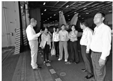
Vietnamese military, government, and media representatives touring the USS George Washington (August 13, 2011)