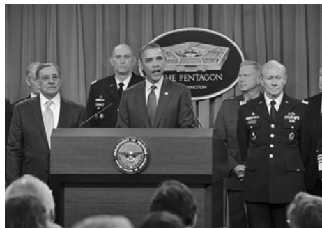
President Obama speaking on the release of the Defense Strategic Guidance (January 5, 2012)

One concern is that the cuts are sudden and drastic. In a letter to Senators John McCain and Lindsey Graham, Secretary of Defense Panetta stated that the sequester could reduce the fiscal 2013