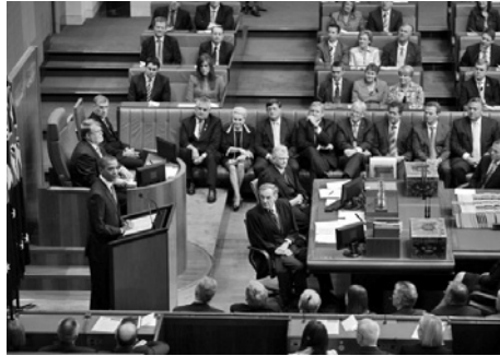
President Obama addressing the Australian Parliament (November 17, 2011)

The choice of this approach was largely shaped by the Obama administration’s