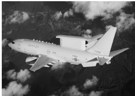
The first two E-737 Peace Eye airborne early warning and control aircraft were delivered to the South Korean military in 2011. A total of four aircraft will be delivered to strengthen surveillance capabilities.

Officials in South Korea's Defense Ministry have said the country would not hesitate to punish local provocations by North Korea. In December 2010, for example, Defense Minister Kim Kwan-jin stated that "if there is another enemy provocation, we will exercise the right of self-defense to punish the enemy forcefully until his willingness to commit provocations is eliminated." In October 2011, Joint Chiefs of Staff Chairman Jung Seung-jo (at that time a candidate for the chairmanship) expressed the same view, stating that South Korea should deploy fighter aircraft in the event of another incident like the shelling of Yeonpyeong Island. Concerns have been expressed in both South Korea and the United States that these types of comments, along with South Korea's preparedness to use active deterrence, could escalate the situation. However, the fact that South Korea's military is under strict civilian control ensures a cautious approach. Furthermore, as discussed later, the United States