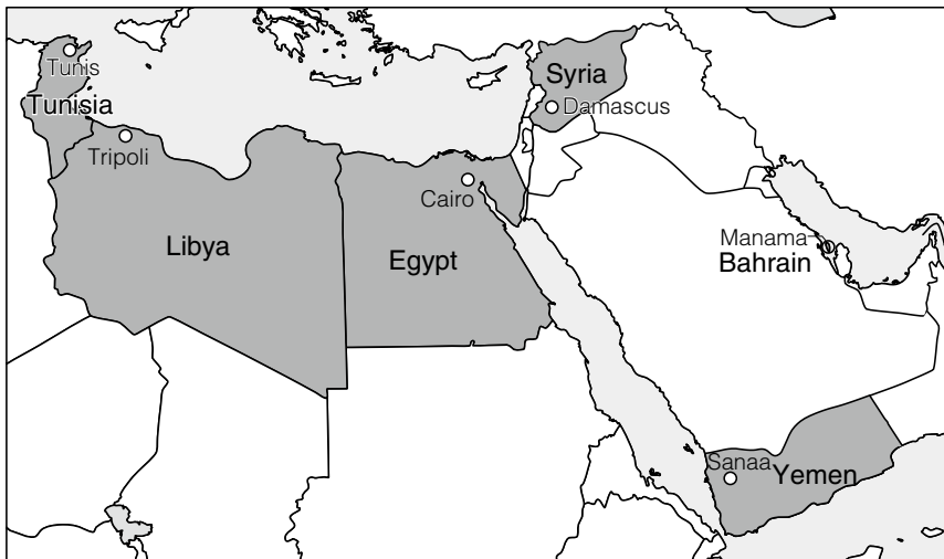
Figure 1.1. The six Arab countries covered by this chapter

That kind of declaration, namely, announcing one's intention not to run in the next election, is a form of political gamesmanship frequently employed by