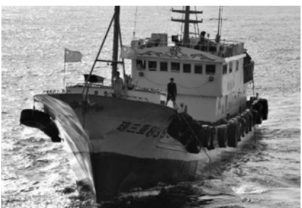
The acoustical surveillance vessel USNS Impeccable (left) and one of the Chinese vessels (right) that harassed its operations

dangerously close to the US vessel and dropped pieces of wood in the Impeccable 's path. These trawlers also moved in front of the US ship, forcing it to stop. The Chinese then tried to snag the Impeccable 's towed acoustic array sonar. Calling these actions by the Chinese boats unlawful interference with the activities of a vessel operating properly in international waters, US officials lodged a formal protest against China.