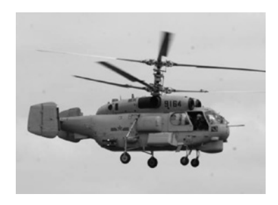
PLA Navy ship-borne helicopter that approached a Japan Maritime Self-Defense Force destroyer (April 8, 2010)

East Sea Fleet, including two destroyers, three frigates, and two submarines, sailed through the Miyako Strait between Okinawa Island and Miyako Island on its way to the Western Pacific, where it conducted various training exercises. The Miyako Strait is located within Japan's EEZ and is defined as international waters, so Chinese warships were free to transit it legally. However, on two occasions between April 8 and April 21, the Chinese acted in a provocative and