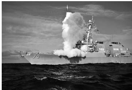
Test-firing of a SM-3 from the Aegis destroyer USS Hopper off the coast of Kauai, Hawaii (July 30, 2009)

Through the development of the SM-3 interceptor, the United States will be able to strengthen ties with allies and partners in the field of missile defense, and such multilateral cooperation will enable the United States to jointly counter the ballistic missile threat. If, as hoped, this cooperative effort leads to a decline in the military importance of ballistic missiles, a decline in the number of countries making serious efforts to acquire such missiles can also be