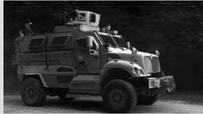
MRAP vehicle

The authorization of large-scale procurement of MRAPs is symptomatic of a shift of US military thinking from the emphasis on conventional warfare capabilities, to a greater focus on irregular warfare capabilities. That said, MRAPs are not without their faults. Being large and heavy, they are reportedly difficult to use on rough roads or in hilly terrain. More mobile versions are currently under development, and the new models are expected to be deployed in a wide variety of regions. Current MRAPs cost between $600,000 and $1 million each, which is 3–7 times the cost of a Humvee with supplemental armor. Even so, they will continue to be regarded as highly effective vehicles for combat theaters facing IED challenges. Consequently, MRAPs are expected to be widely used, not only by the United States, but by many other countries as well.