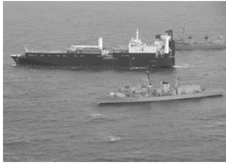
PSI maritime interdiction exercise “Pacific Shield 07”

maritime interdiction exercise that included SDF participation in joint training in Yokohama Port, Yokosuka Port, and waters near Oshima. The highly successful exercise was conducted with the aims of enhancing deterrence against WMD proliferation, improving the coordination of nonproliferation efforts among the international community, and encouraging non-PSI members