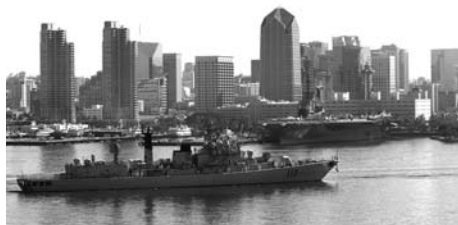
The Chinese destroyer Qingdao entering the port of San Diego (September 18, 2006)

vessels, strategic dialogue; cooperation in dealing with nontraditional security threats; joint counterterrorism exercises; and the mutual exchange of observers to military exercises. Although it is the Hu administration that emphasizes the importance of military diplomacy, military exchange programs were also conducted in the Jiang Zemin era. For example, in 1997 a formation of two destroyers