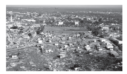
The coastal areas of Sumatra, Indonesia, devastated by the tsunami

March 29, 2005, an earthquake registering 8.7 on the Richter scale struck Nias Island, near the epicenter of the December 2004 quake. A large number of buildings collapsed and more than 900 lives were lost.