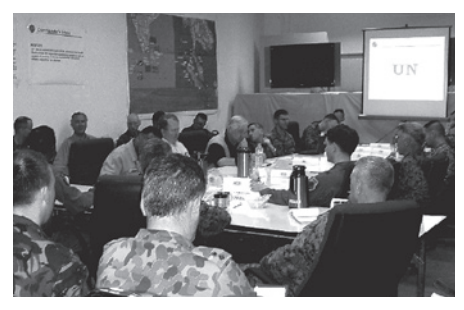
A briefing held at CSF-536 headquarters

opened a forward office of its Military and Civil Defense Unit in Bangkok and dispatched UN Civil Military Coordination Officers to: Utapao in Thailand; Jakarta, Banda Aceh, Meulaboh, and Medan in Indonesia; and Colombo in Sri Lanka. When the demands for assistance were not met at the local level, the CSG operating in each country would coordinate