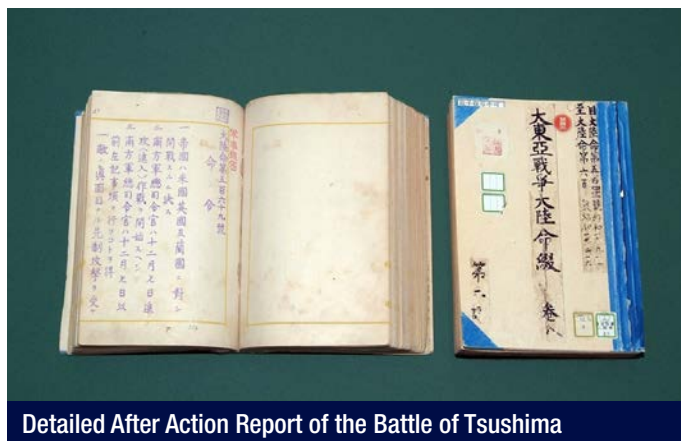
Detailed After Action Report of the Battle of Tsushima