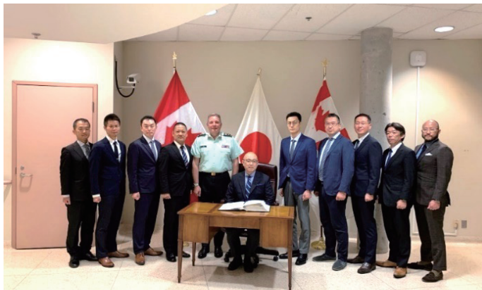
Onsite Training Outside Japan

Additionally, the program offers the Strategic Studies Program (SSP), which grants a Master's degree in Policy Studies upon completion of this course and the fulfillment of certain credit requirements at the National Graduate Institute for Policy Studies (GRIPS). Each year, approximately 10 participants are awarded this degree.