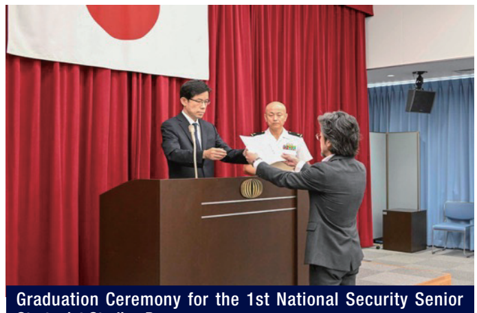
Graduation Ceremony for the 1st National Security Senior Strategist Studies Program